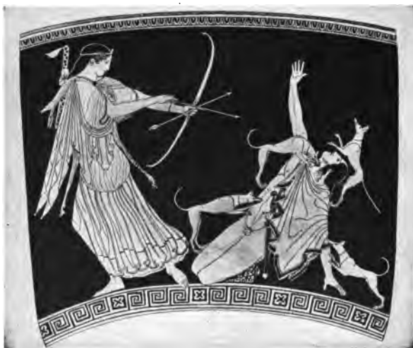
Fig. 22. Actæon killed by his Dogs.

water his human form was changed to that of a stag; and not his form alone, for trembling fear entered his once bold heart and he fled, dreading alike the woods and his own home and former companions. As he fled, his own dogs, driven mad by Artemis, saw him and gave chase, all fifty of them. Over hills and rocks he fled and